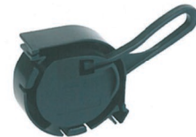
Recommended clamp TELENCO Code 7593