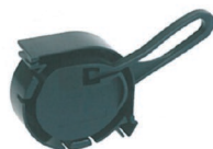
TELENCO Code 7593

Max. Change Attenuation* ( fully reversible after decrease load )